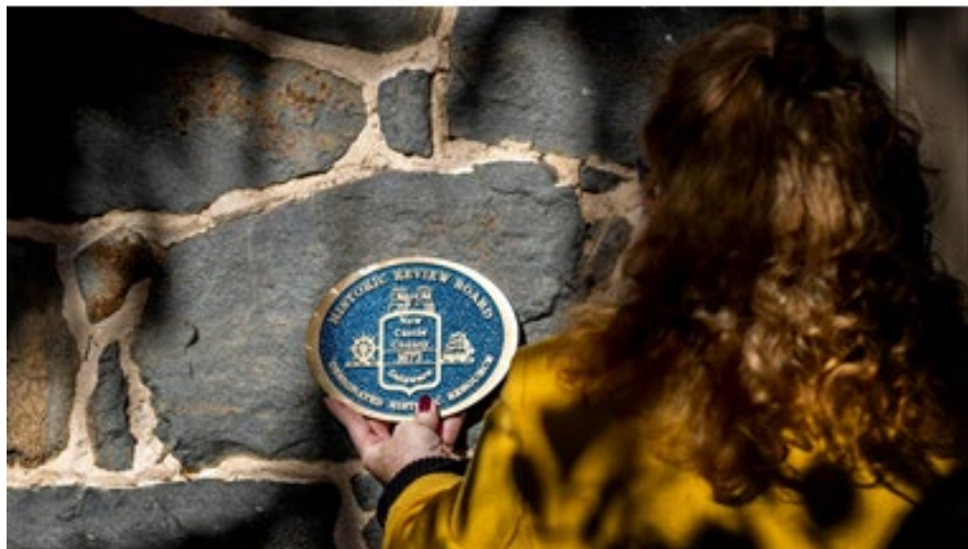
Figure I-1: Example of County historic marker

As a way of celebrating New Castle County’s historic resources and appreciation of the stewards of the County’s historic buildings, the Historic Marker Program was implemented in the winter of 2020. The program allows owners of County Historic overlay zoning districts to place a marker identifying that a structure is an officially designated New Castle County historic resource. So far, two historic markers have been placed on County historic resources since the program’s implementation (See Figure I-1 ).