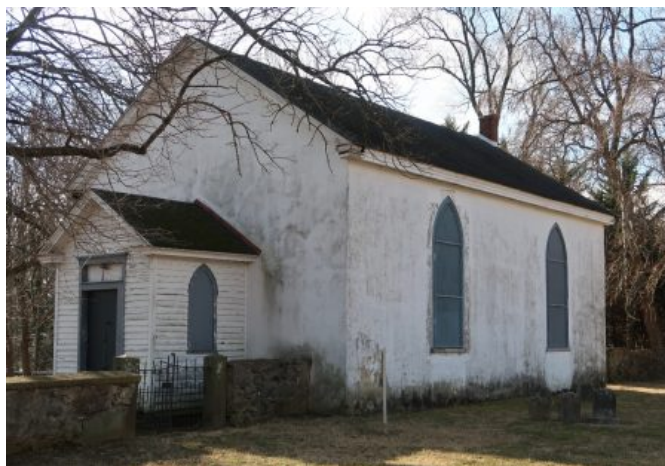
Figure I-4: Newark Union Church and Cemetery

Listed on February 6, 2020, Newark Union Church and Cemetery (See Figure I-4 ) served a wide range of religious groups for a total of nearly 300 years including Quakers, Methodists, Presbyterians, Anglicans and non-denominational Christians. Both the cemetery (founded in the late-17th century and still accepting burials) and the surviving Newark Union Church (built in 1845 and remodeled in 1906) represent the evolving religious demographics of residents north of Wilmington.