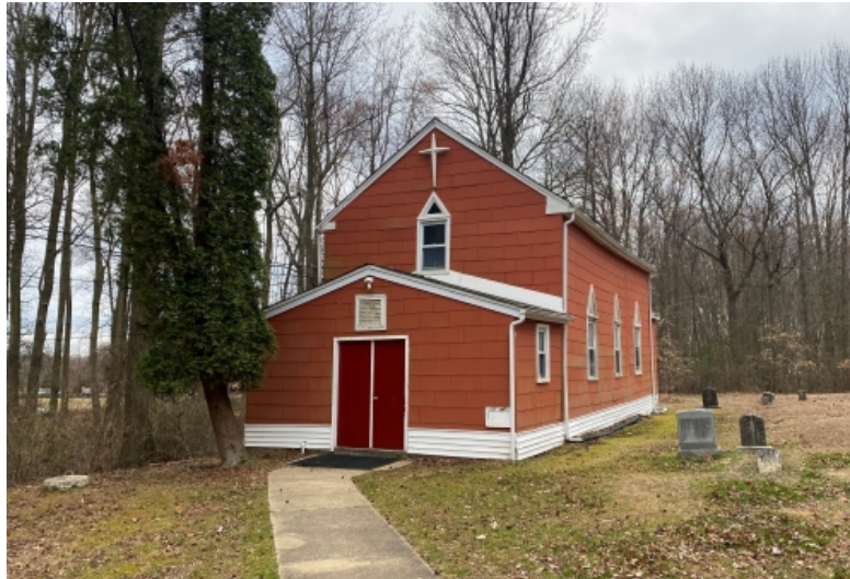
Figure I-5: (St. Daniels) African Union Church and Cemetery of Iron Hill

Listed on September 9, 2021, St. Daniels Church was constructed between 1852 and 1856 and is locally significant as the oldest known surviving, free Black church in northern Delaware that was built as part of Peter Spencer's African Union Church movement (See Figure I-5 ).