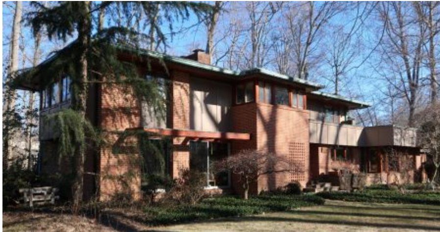
Figure I-3: Florence and Isaac Budovitch House

Listed on January 30, 2020, the Florence and Isaac Budovitch House was constructed between 1955 and 1956 (See Figure I-3 ). This Contemporary style dwelling was designed by New York architect Edgar Tafel, an apprentice of Frank Lloyd Wright, and features distinctive Prairie School/Wrightian influences. The Budovitch House is significant at the local level as the only known Tafel-designed commission in the State of Delaware and as an excellent example of well-preserved mid-20th century Contemporary residential architecture.