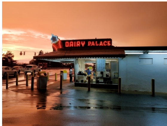
Figure I-2: Historical photos of Parkers Dairy Palace